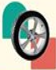
Transportation Industry (Electric and Autonomous Cars)