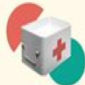
Healthcare (Prioritizing Medical Care in Emergencies)