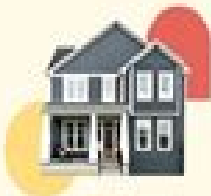
Home Appliances (Smart Refrigerators)