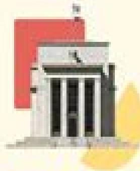
Banking Industry (Robo Advisors and Risk Management)