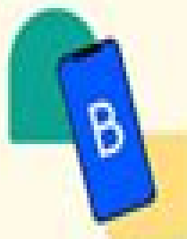
Social Media (Facebook User Recommendations)