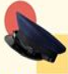
Law Enforcement (Facial Recognition)