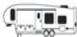
Travel Trailers/ 5th Wheels

Find prices and values for all recreation vehicle (RV) types below