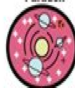
Temporal Species Evolution Paradox