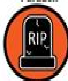
Temporal Afterlife Paradox