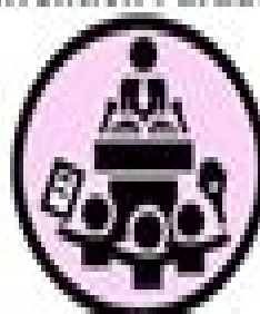
Temporal Democracy Paradox