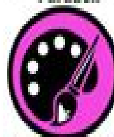
Temporal Artistic Influence Paradox