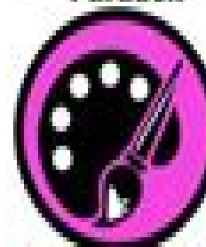
Temporal Artistic Influence Paradox