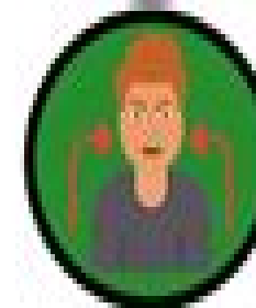
Meeting Yourself Paradox