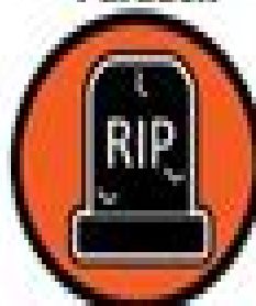
Temporal Afterlife Paradox