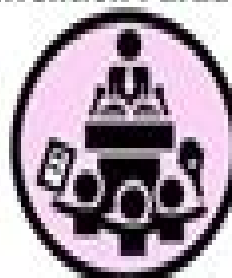
Temporal Democracy Paradox