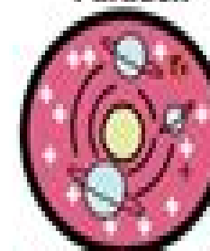
Temporal Species Evolution Paradox