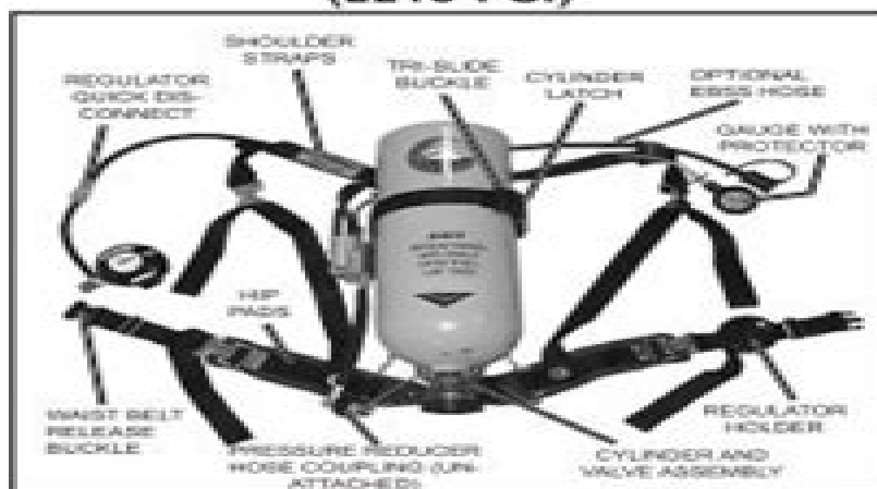
TYPICAL INDUSTRIAL SCBA 2216 PSI W/ OPTIONAL ACCESSORIES

For Use With 2216 PSI Cylinders of 30 Minute Rated Duration