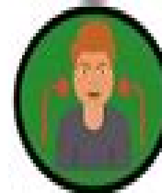
Meeting Yourself Paradox