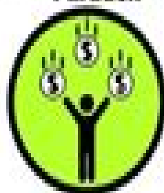
Temporal Lottery Paradox