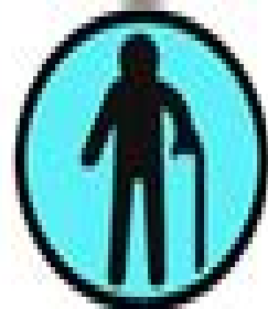
The Grandfather Paradox