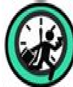
Novikov Self Consistency