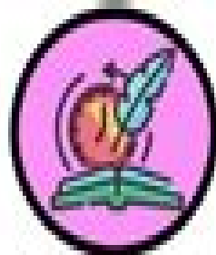
The Bootstrap Paradox