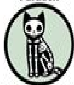
Schrodinger's Time Traveler Paradox