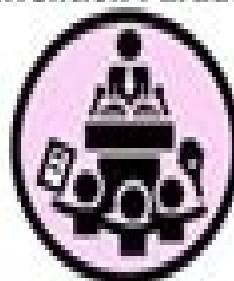
Temporal Democracy Paradox