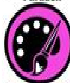
Temporal Artistic Influence Paradox