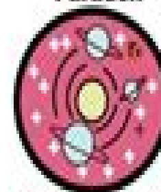
Temporal Species Evolution Paradox