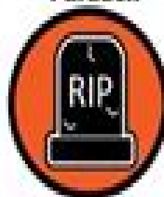
Temporal Afterlife Paradox