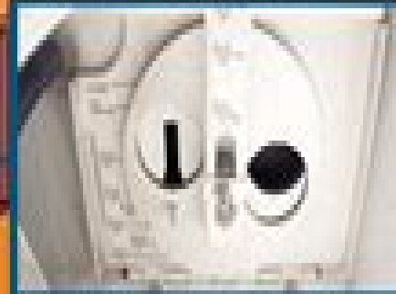
Entrada de aire