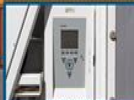
Panel de control