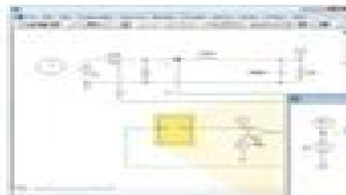
Right: Control circuit in a subcircuit