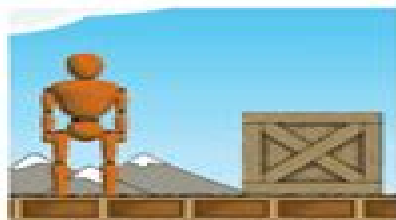
Sam not pushing

a. Using what you learned by exploring, try drawing arrows to predict what might happen in the pictures below. (Try this part without using the simulation.)