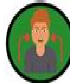
Meeting Yourself Paradox