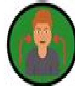
Meeting Yourself Paradox