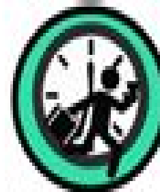
Novikov Self Consistency