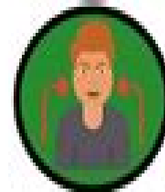
Meeting Yourself Paradox