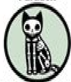
Schrodinger's Time Traveler Paradox