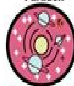
Temporal Species Evolution Paradox