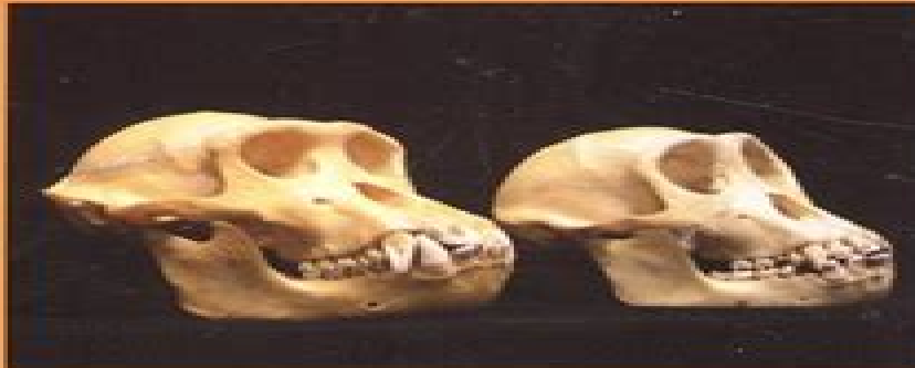
Male and Female Chimpanzee