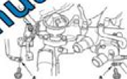
Fig. 24: Identifying Ground Cables Courtesy of AMERICAN HONDA MOTOR CO., INC.

J35A6 and J35A7 engines: Remove the ground cables (A).