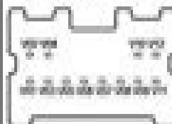
J204 NDS Connector (A12 MW)