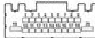
J502 Main Connector (TH18)