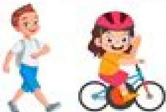
Bike or walk instead of driving