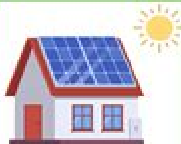
Install solar panels