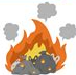
Burn leaves and trash