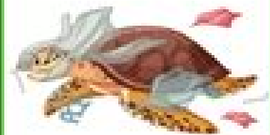
Use plastic bags