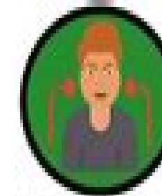
Meeting Yourself Paradox