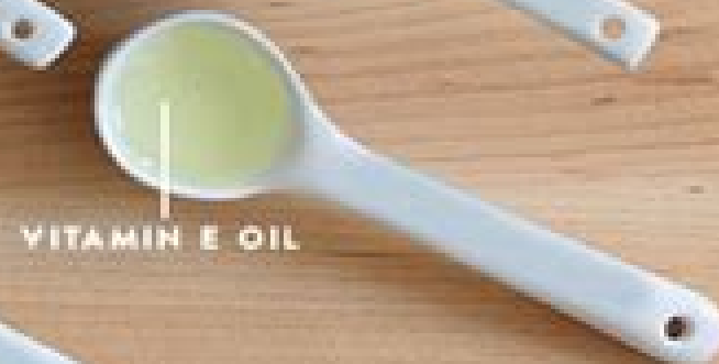
VITAMIN E OIL